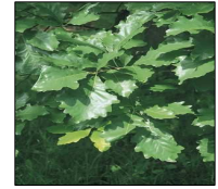
Swamp White Oak